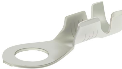
picture shows a tin-plated type