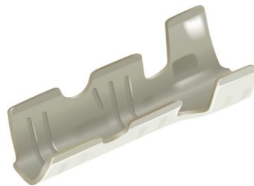
Bild zeigt eine verzinnte Ausführung